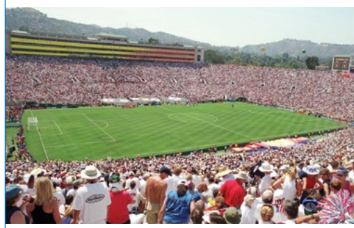
The 1999 Women's World Cup, held at the Rose Bowl.

IMPACT | The guidelines confirmed that institutions can choose which of the three conditions they plan to meet in order to provide nondiscriminatory participation opportunities for individuals of both sexes, and clarified how Title IX requires the OCR to count those opportunities.